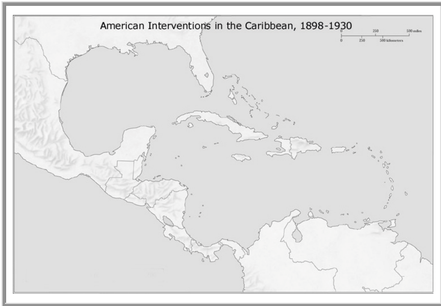
American Interventions in the Caribbean, 1898-1930—Blank Self Study Map